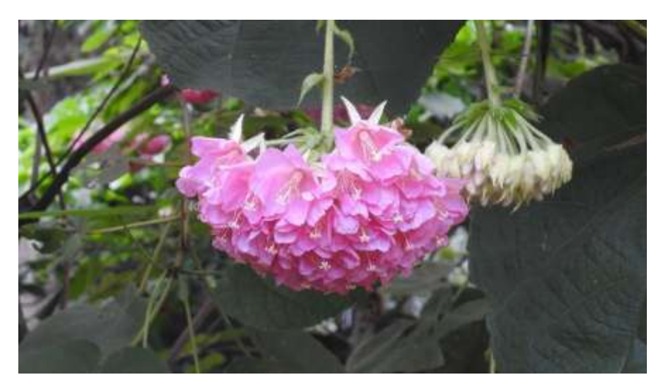
Pic 1. Shape of the flower of D. wallichii according to https://powo.science.kew.org/taxon/ urn:lsid:ipni.org:names:823281-1/images

by Skema (2010) molecular data, rare native separation is poor and understood till now, addition the collected specimens have no associated location data with them (Skema, 2014). The data are scarce about the distribution and spread species where it is reported as introduced in North America, Central America, Asia et al. (2021) studied the Emeries' cultivate, D. wallichii . In Iraq has been in known as a strange and uncommon plant, but it has been successfully cultivated in middle and south regions (Ibrahim et al., 2023).